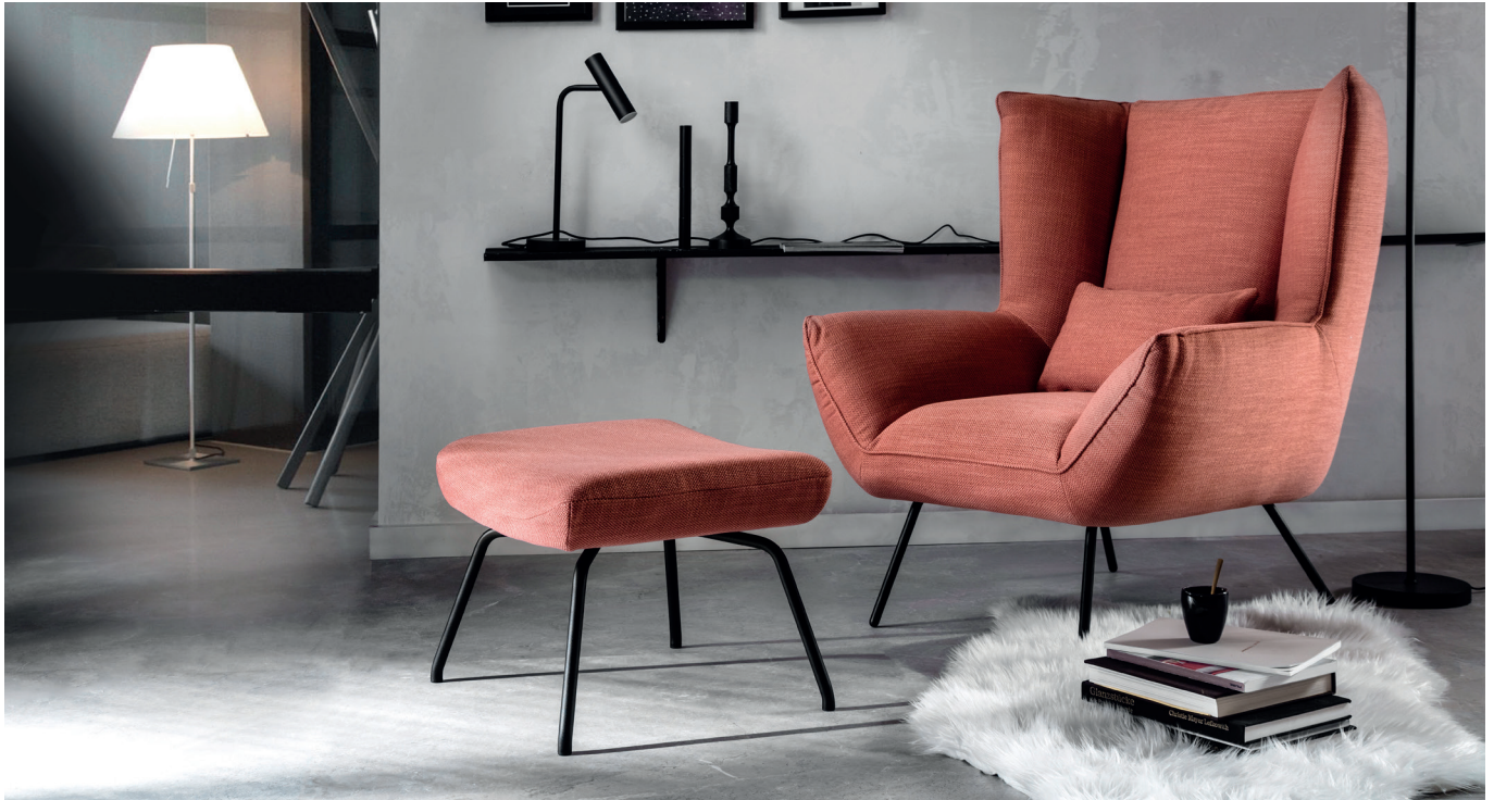
Armchair and Stool